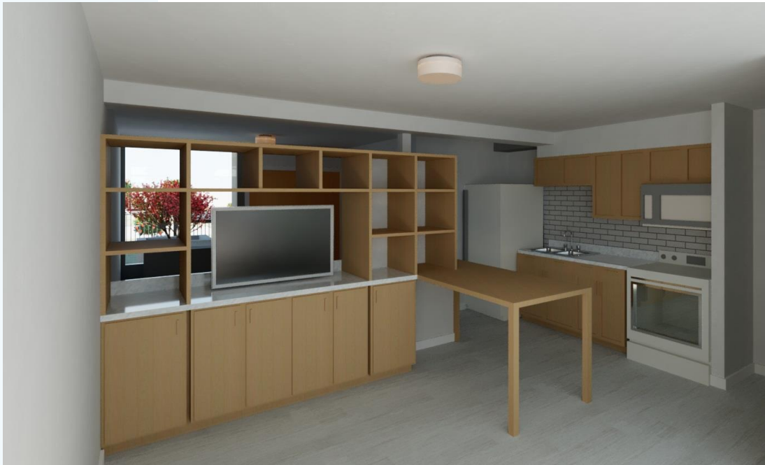
Maley Interior View